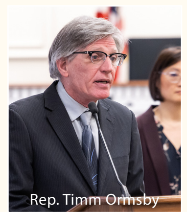
Rep. Timm Ormsby